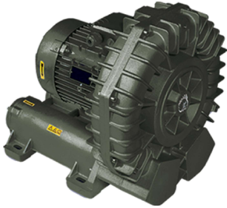
LCX (AIR & BIOGAS APPLICATIONS)